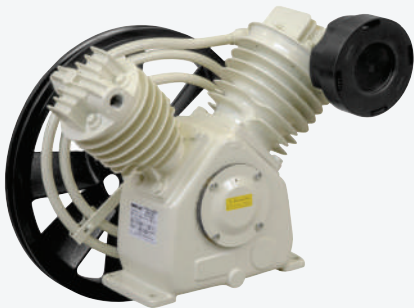
1-3 HP Two Stage Compressor

• Each compressor shall include a discharge check valve of brass construction, an ASME safety relief valve, intake and discharge flexible connectors, a solenoid valve discharge line unloader, an isolation valve, an air cooled aftercooler, a moisture separator with automatic drain, and a high discharge temperature shut down switch on each cylinder.