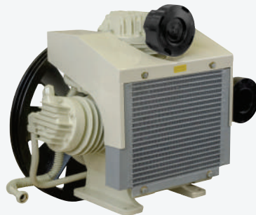
4-5 HP Three Stage Compressor